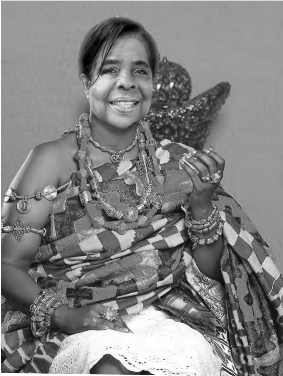
ASAFOHEMAA ADZOA AKORLIWAA II